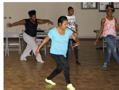
Rehearsals underway at Claremont Courts

Wednesday, August 16, 2:00 pm Claremont Courts Community 2702 Patio Place